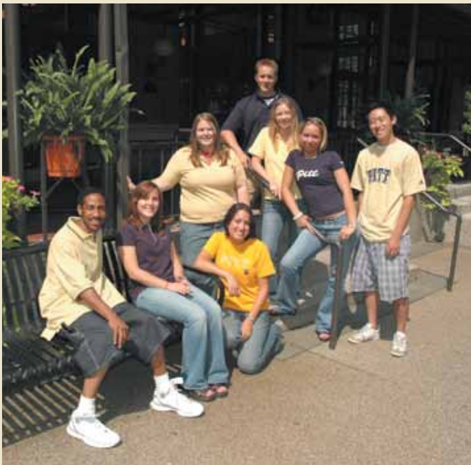
Outside the William Pitt Union

NO SERVICE SATURDAY, SUNDAY, AND DAYS WHEN THE SHUTTLE SYSTEM OPERATES ON A HOLIDAY SCHEDULE.