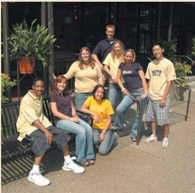
Outside the William Pitt Union

NO SERVICE SATURDAY, SUNDAY, AND DAYS WHEN THE SHUTTLE SYSTEM OPERATES ON A HOLIDAY SCHEDULE.